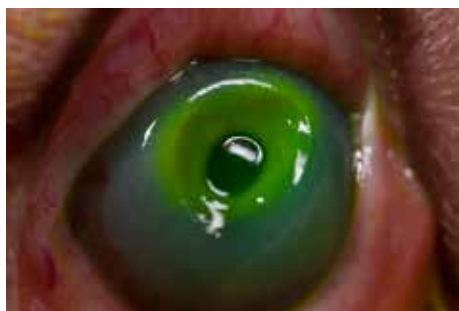
Figure 5: An image of a corneal ulcer with keratomalacia (a “melting” corneal ulcer). The corneal epithelium has been lost and the stroma, which is composed of collagen, has degenerated.