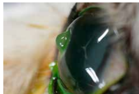
Figure 6: An image of a protruding corneal bulla (a blister) that is retaining fluorescein dye. This must be differentiated from a protruding descemetocele which will not retain fluorescein dye. Corneal bullae are treated medically, whereas descemetocele requires surgical repair.