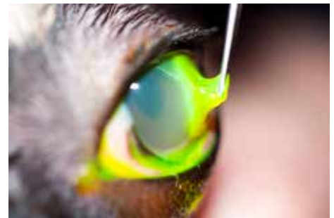
Figure 7: An image of a cornea with a descemetocele with loss of corneal stromal collagen.

Ulceration of the cornea eliminates the corneal epithelium (barrier) and permits surface bacterial attachment to the corneal stroma—a necessary requisite to establishing bacterial infection. Despite corneal stromal exposure, most corneal ulcers are not infected. Only two indications exist for administering a topical antibiotic when corneal ulceration exists: 1) to prevent infection from occurring, or 2) to treat infection. The difference between preventing infection and treating infection is vastly different regarding the selection of an appropriate topical antibiotic. Some topical antibiotics are more toxic to the corneal epithelium and delay wound healing (gentamicin, ciprofloxacin) whereas others are far less toxic and minimally delay corneal wound healing (tobramycin, ofloxacin). When an ulcer is not infected or complicated, a broad-spectrum topical antibiotic that does not penetrate into corneal tissue (tobramycin, bacitracin-polymyxin-gramacidin) is recommended to prevent infection. When an ulcer is complicated or infected, a topical antibiotic that penetrates deep into corneal stromal tissue is recommended (ofloxacin, marbofloxacin). Treatment of a corneal ulcer with a topical antibiotic will not speed re-epithelialization or healing; likewise, changing topical antibiotic treatment because an ulcer has not healed