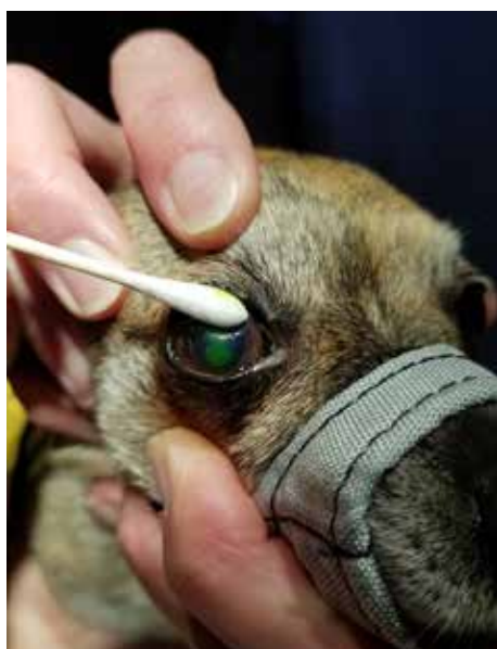
Figure 1 (top): Image of an eye with a spontaneous chronic corneal epithelial defect (SCCED) stained with fluorescein dye. Note the fluorescein dye undermining the edges of the epithelial layer and the diagnostic “lip” of loose epithelium.