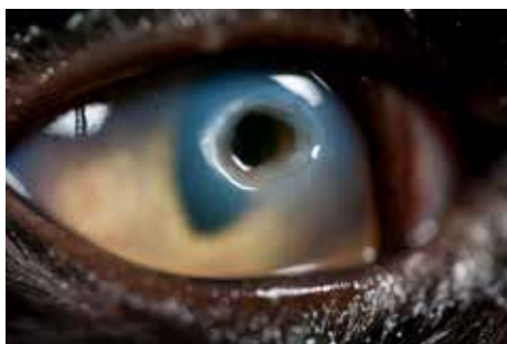
Figure 4: An image of a “melting” corneal ulcer. Note deep neovascularization completely surrounding the ulcerated cornea with degenerated stromal collagen which masquerades as a mucoid discharge.

Depending on the size and depth of the ulcer, and whether vascularization of the corneal stroma is present, a conjunctival graft may be necessary to provide tectonic support in order to prevent rupture, and to provide a vascular supply to favor healing. A conjunctival graft consists of transposing a thin layer of only conjunctival membrane tissue onto the cornea to provide tectonic support and to provide a vascular tissue supply to aid in healing. Surgically transposing a vascular supply (conjunctival graft) to the ulcer also provides leukocytes and antibodies to provide antimicrobial and anti-collagenase effects, as well as delivers systemic antibiotics to the site. Third eyelid flaps are never recommended and are contraindicated for treatment of infected, deep or complicated ulcers since they prevent direct visualization and re-