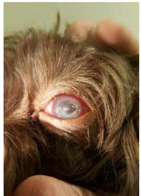
Figure 8: An image of a descemetocele stained with fluorescein dye. Note the corneal stroma retaining fluorescein dye and absence of fluorescein dye retention by exposed Descemet's membrane. Exposed corneal stroma also retains tear fluid, resulting in corneal edema.