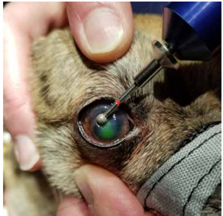
Figure 3: Image of the same eye shown in Figure 2 while performing diamond burr keratotomy.

©HEARTGARD and the Dog & Hand logo are registered trademarks of Merial. ©2015 Merial, Inc., Duluth, GA. All rights reserved.